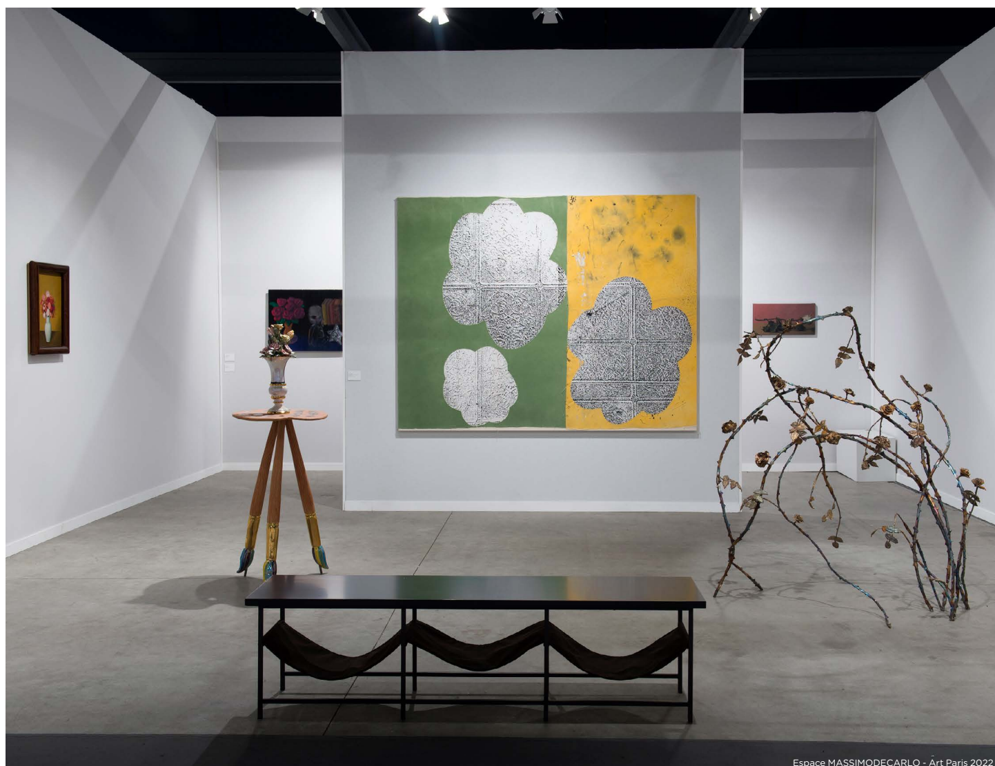
Espace MASSIMODECARLO - Art Paris 2022

*The life cycle assessment (LCA) takes into account a multitude of criteria to provide an overall view of the environmental impact of a product or process, listing and quantifying the materials and energy used throughout a product's entire lifetime. Whether the subject of consideration is a product, a service or a process, every stage of its life cycle is considered to establish an inventory of the relevant inputs and outputs from cradle to grave: extraction and processing of raw materials (including energy sources), manufacturing, distribution, usage and end-of-life disposal, not forgetting the various phases of transport.