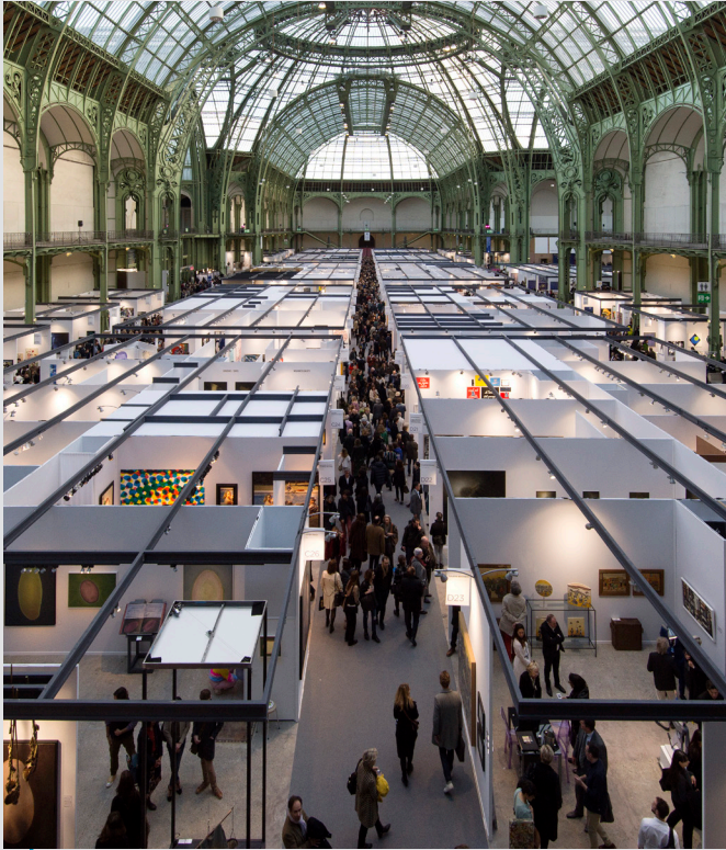
Art Paris - © Marc Damage

In February 2025, she will curate Luxe Calme et Volupté to mark the reopening of the Centre d'Art La Malmaison in Cannes. The exhibition will look at the painters who travelled to the South of France, while considering hedonism and the way in which it creates parallels between modern and contemporary artists.