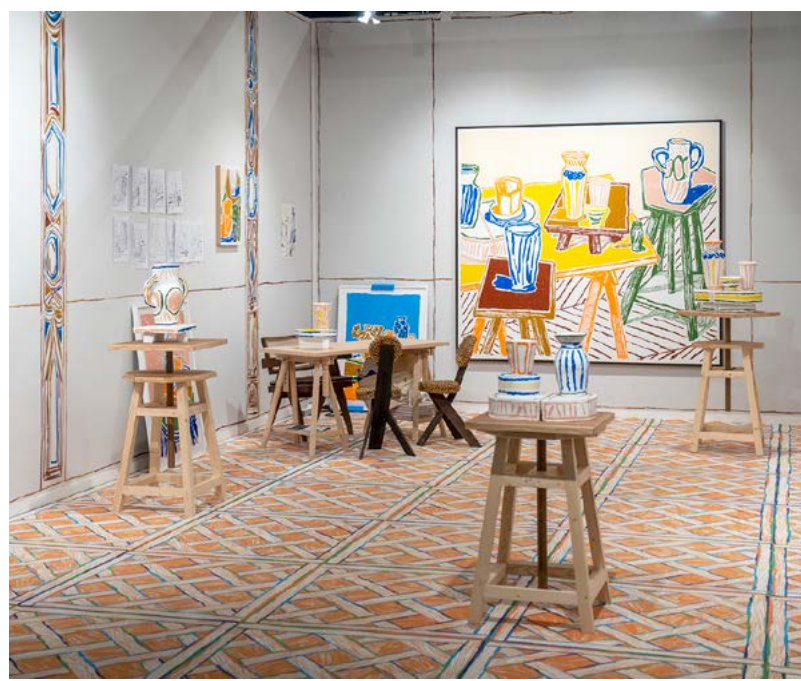
Art Paris 2023 - Galerie Derouillon