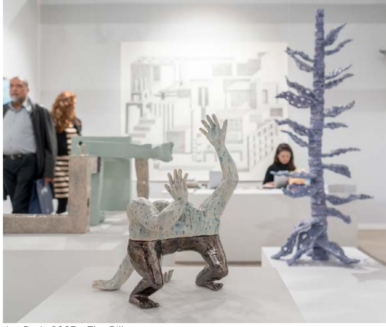
Art Paris 2023 - The Pill